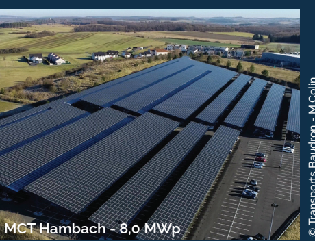
Transports Baudra Trone Expert Servic

The Urbasolar group is a key player in solar photovoltaic. With a developed expertise in the creation of parking canopies, Urbasolar is today one of the recognized leaders in the field. With installations of every capacity, the group can accompagny the transformation of secure truck parking areas to create electricity producing units.